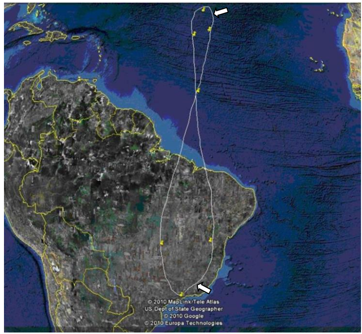
Special Points in Analemma